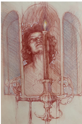
Candlelit, Pencil and Chalk